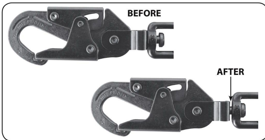
5.1 Before and After of Load Impact Indicator

The Self-Retracting Lifeline has a load indicator that is built into the snap hook and is located at the swivel part of the snap. The swivel eye will elongate and expose an area below the hook as seen below in the image. This indicates that the Self-Retracting Lifeline has been involved in a fall arrest situation and that the Self-Retracting Lifeline should be removed from service to avoid serious injury to the user. Any questions please contact the manufacturer.