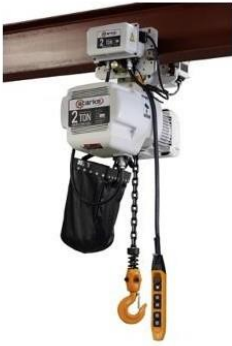
Hoists & Trolleys

Contact Your Starke Representative for More Information on Products to Help Maximize Your Workplace Efficiency