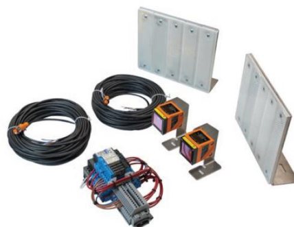
Dual Event Twin LASER