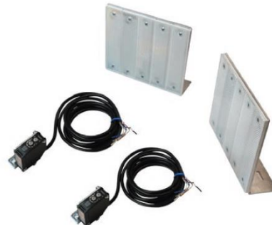
Single Event Twin LED