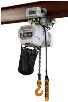
Hoists & Trolleys

Contact Your Starke Representative for More Information on Products to Help Maximize Your Workplace Efficiency