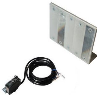
Single Event LED