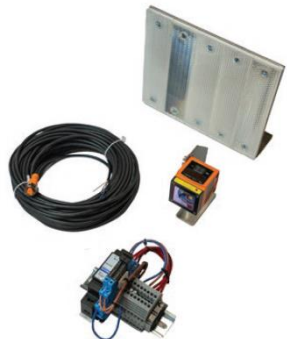
Dual Event Single LASER