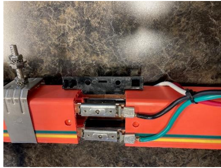
Center power feed Kit

1.3a For long runway systems a “center power feed” option is available. (see parts list)