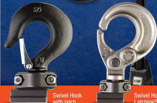
Swivel Hook with latch