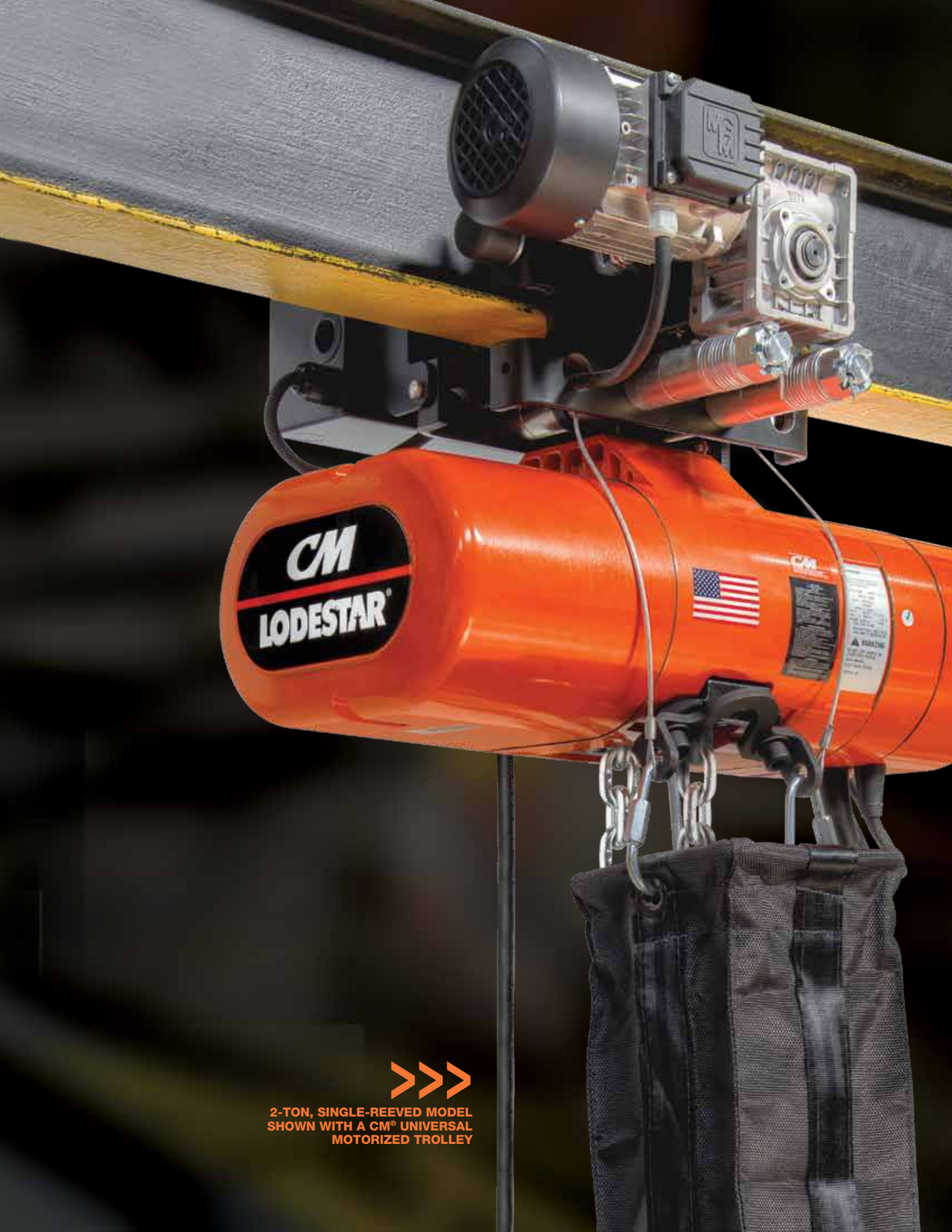
>>> 2-TON, SINGLE-REEVED MODEL SHOWN WITH A CM® UNIVERSAL MOTORIZED TROLLEY