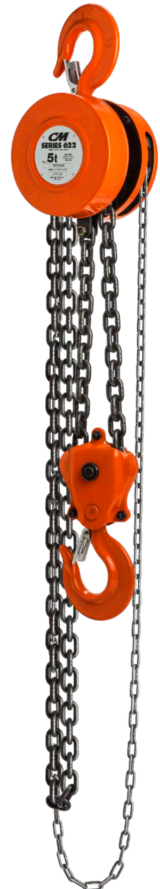
CM SERIES 622 5 TON