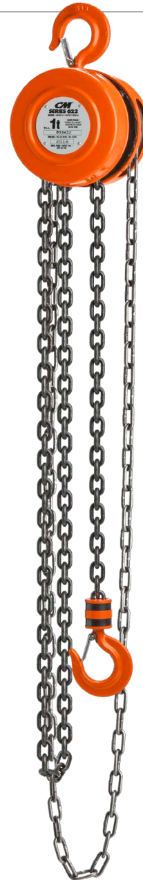
CM SERIES 622 1 TON