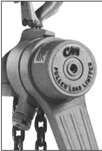
Optional Load Limiter